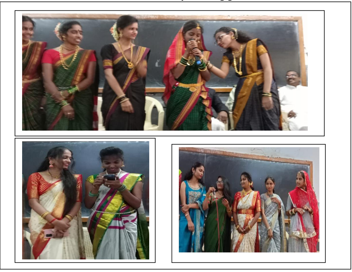
Songs by the beautiful dames